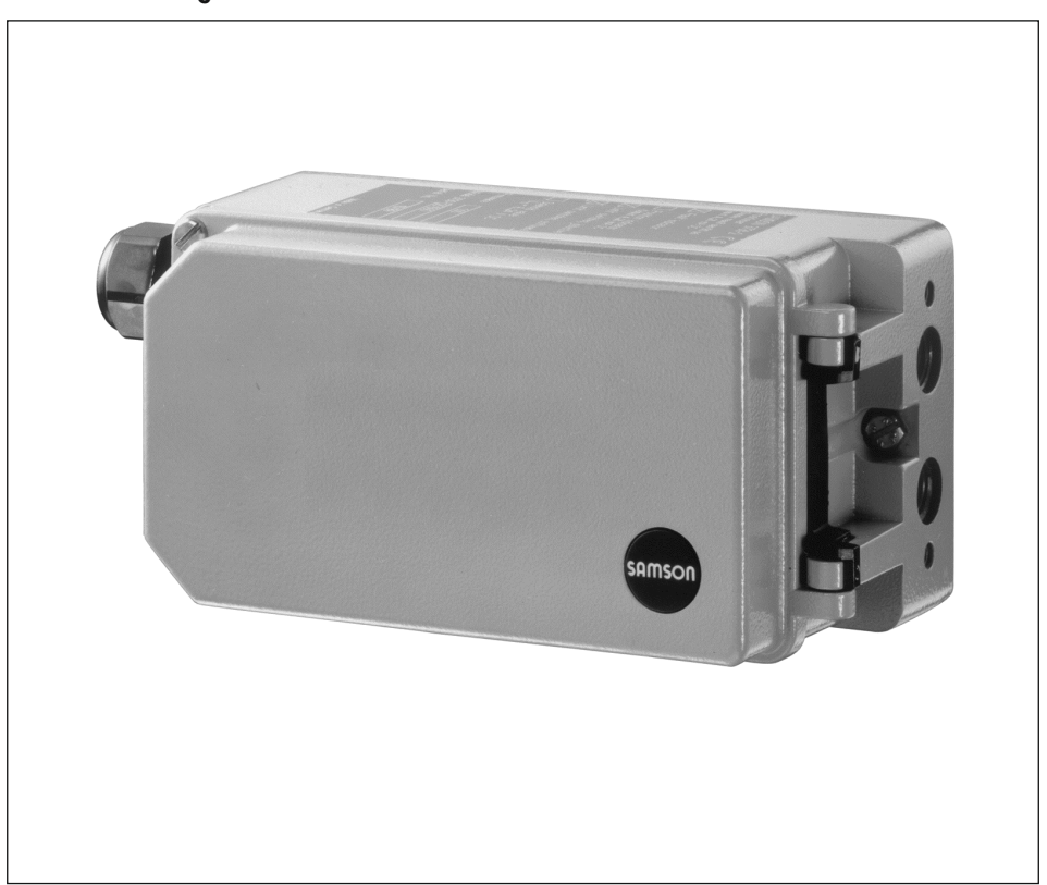
Type 3730-0 Electropneumatic Positioner